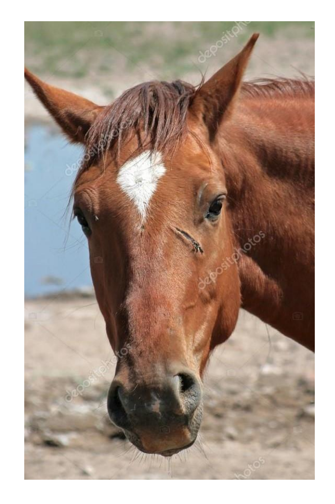
<<<< \ Scar A mark left by an injury that has healed